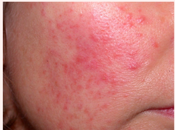
Figure 2: Mild papules and pustules