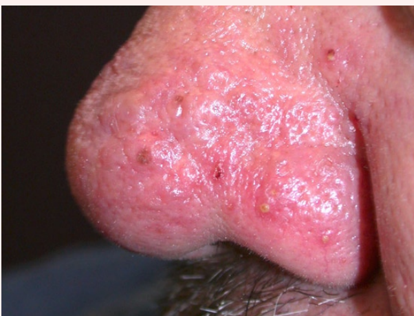
Figure 3: Early rhinophyma and inflammatory papules