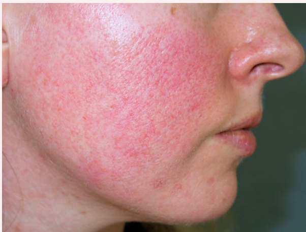
Figure 1: Telangiectasia

Ocular rosacea (Figure 4) is characterised by inflammation of the eyelid and the eye, which may include the conjunctiva and cornea, and rarely the iris and sclera. 5,10