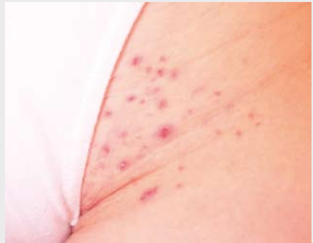
Figure 6: Folliculitis due to shaving pubic hair (Supplied by Amanda Oakley / Dermnet NZ).

indicated unless there is associated cellulitis or systemic symptoms. 35 If required, broad spectrum antibiotic cover is necessary as the infection is usually polymicrobial.