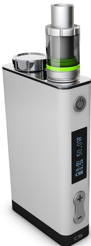
Figure 1: An example of a vaping device