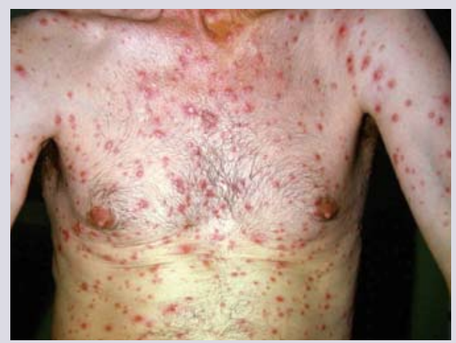
Figure 2: Disseminated rash in secondary syphilis Pox